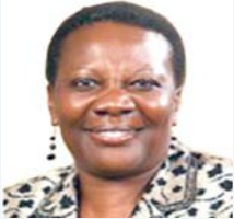
Eng. Irene Muloni, Minister for Energy and Mineral Development.