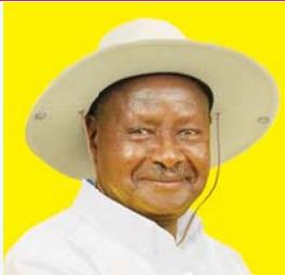
H.E. Yoweri Kaguta Museveni President of the Republic of Uganda