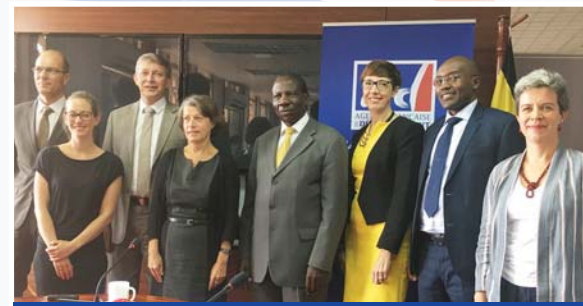
French and Ugandan officials at the signing of the Financing agreement for the 44.7MW Muzizi Hydro Power Project.