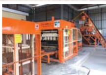
Automatic Block Making Machine

The Management and Staff of China Huangpai Food Machines (U) Ltd congratulate H.E Yoweri K. Museveni, the President of the Republic of Uganda and all Ugandans upon the 33rd anniversary of the National Resistance Movement leadership.