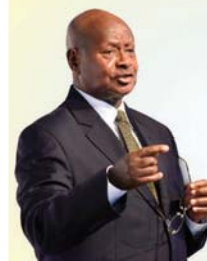
H.E. YOWERI MUSEVENI PRESIDENT OF THE REPUBLIC OF UGANDA

The Board of Directors, Management and Staff of Bavima Enterprise and Bavima Steel Ltd congratulate the President of the Republic of Uganda H.E Yoweri Kagame Museveni, all the People of the Republic of Uganda on the NRM 33 rd anniversary, and congratulate the people of India on the Indian republic day.