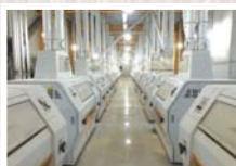
Wheat Processing Plant