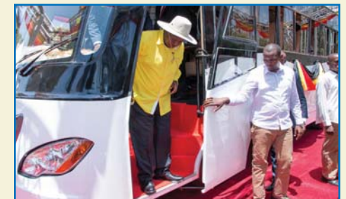
H.E. The President disembarking from Kayoola Solar Bus upon its being Launched

marble for the establishment of steel industry, sheet glass plant and cement plant in Moroto District respectively.