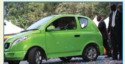
H.E. The President launching the KIIRA EV at Makerere University