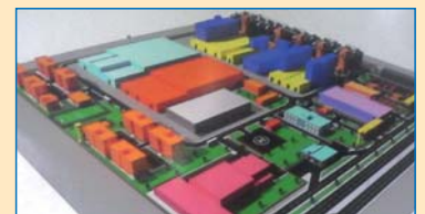
Food city complex to add value to grain cereal