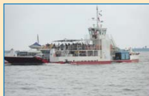
The MV Pearl Ferry transporting passengers and goods on Lake Victoria