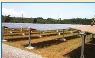
Solar Panels at the Bukuzindu Hybrid Solar Plant that supplies Electricity to the Islands in Kalangala District