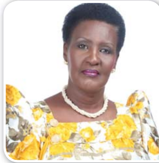
HON. AMELIA KYAMBADDE MINISTER OF TRADE, INDUSTRY AND COOPERATIVES