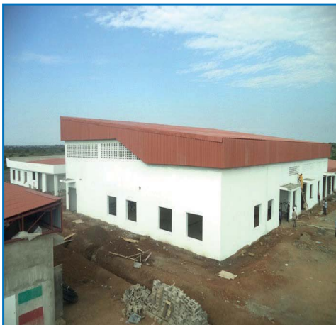
Soroti fruit factory opening in March 2017

The ground breaking for the construction of the fruit factory took place on September 28, 2014 by His Excellency the President, Yoweri Kaguta Museveni. The construction of the factory commenced in April 2015 and is scheduled to be completed by October 2016. Thereafter, installation and commissioning of machinery and equipment will be done from December 2016 to March 2017 while Commercial operation of the factory is scheduled to commence in April 2017.