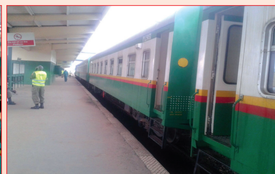
Passenger Train to and from Kampala on working days