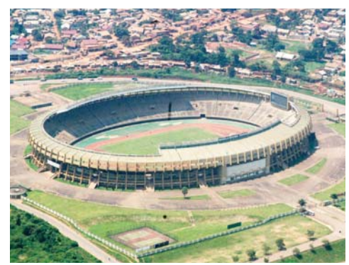
Namboole stadium was also built by China

Vision Group for working with the embassy to promote China-Uganda relations.