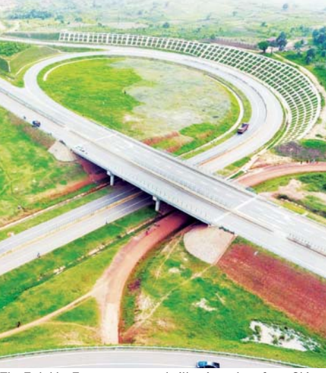
The Entebbe Expressway was built using a loan from China