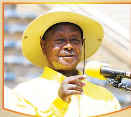
His Excellency Yoweri Kaguta Museveni The President of the Republic of Uganda