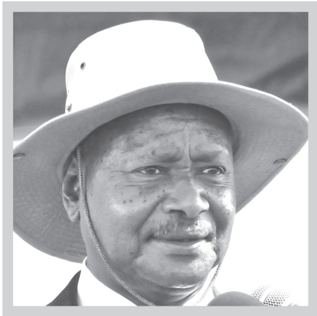
H.E The President of the Republic of Uganda Yoweri Kaguta Museveni

Congratulatory Message to His Excellency the President of the Republic of Uganda on The Anniversary of 30 Years of NRM Government.