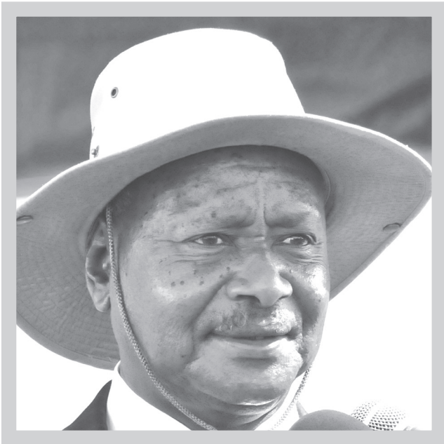
H.E The President of the Republic of Uganda Yoweri Kaguta Museveni

Congratulatory Message to His Excellency the President of the Republic of Uganda on The Anniversary of 30 Years of NRM Government.