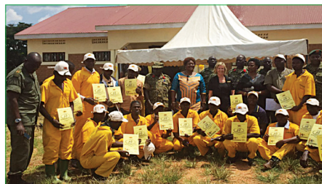
Hon. Sarah Kataike Ndoboli the outgoing Minister of State for Luwero Triangle poses with youth that were trained in the use of hydra form technology

Each block yard was supported with an M7 hydra form twin machine for producing interlocking blocks; a Vibra V3SE Conventional Block and paving machines; a Hydra form mobile Jaw Crushers for crushing rocks and stones; a hydraform 300 litre mobile pan mixers for mixing soil and cement mixture; and a hydra form rotary sieves for preparations of soil for block production. Each of the Block Yards will be provided with one Tipper Lorry to assist in the transportation of their materials and products.