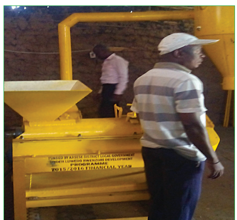
Maize mill for Mihayo Development Forum; Kasese District supported under LRDP Funding