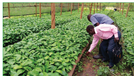
Coffee seedlings for Kabalega Veterans Association ready for sale at Mulama, Kapeeka; Nakaseke District