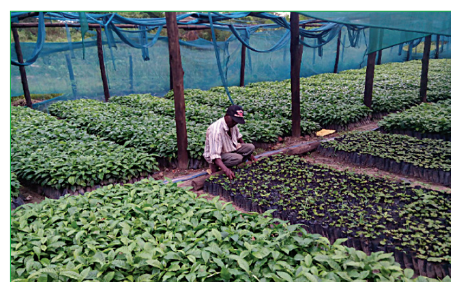
Ready seedlings at Kaloke Semuto SC for Tusitukirewamu Veterans Association; Nakaseke District