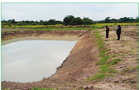
A community valley tank at Naivasha, Wansarangi, Wakyato; Nakaseke District