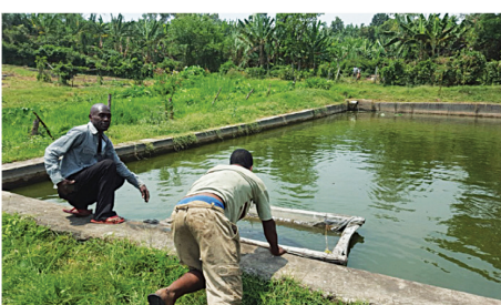
Members of RUDEC, Kabarole District taking care of their fish pond