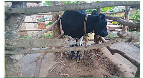
A heifer given to Agoryawamu mens group in Kalagi Mulagi sub county Kyankwanzi district