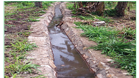
Water stream diversion for small scale farm irrigation in Munkunyu; Kasese District.