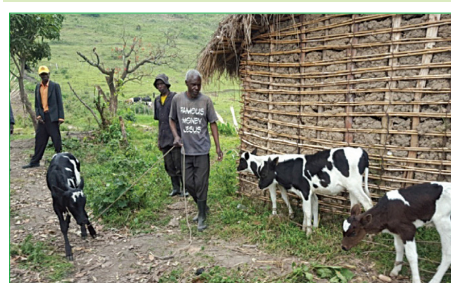
Members of Bukara Parish B Coy civilian veterans Association with calves that had been produced by the heifers that bought by the group with LRDP funds.