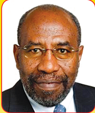
Hon. Dr. Ruhakana Rugunda Prime Minister of the Republic of Uganda