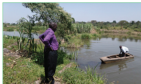
Figure 1 farmer supported with a valley tank for fish farming in Kyankwanzi