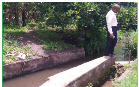
Water stream diversion for small scale farm irrigation in Munkunyu; Kasese District.