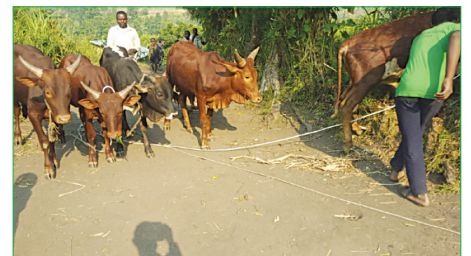
Bull fattening project for Kithoma II Youth group, Ntoroko District.