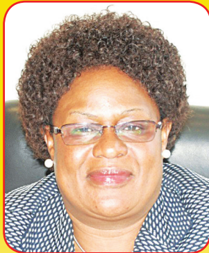
Hon. Kataike Sarah Ndoboli, Outgoing Minister of State for Luwero Triangle