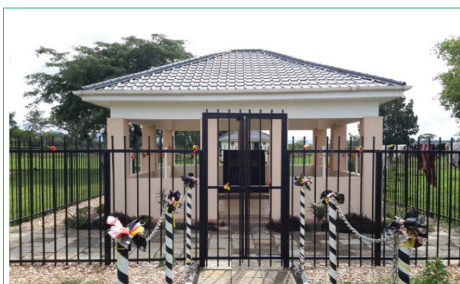
War Heroes' Monument at Dwaniro Sub-County, Kiboga District