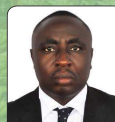
Hon. Christopher Kibanzanga State Minister for Agriculture