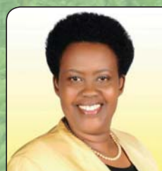
Hon. Joy Kabatsi State Minister for Animal Industry