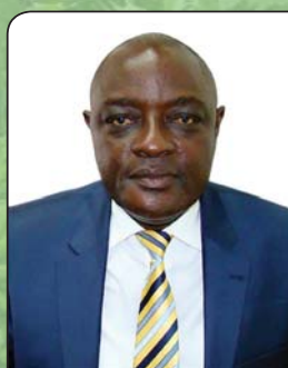
Hon. Vincent Bamulangaki Sempijja Minister for Agriculture, Animal Industry and Fisheries