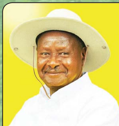
H.E. Yoweri Kaguta Museveni The President of the Republic of Uganda

Ministry Vision: "A competitive, profitable and sustainable agricultural sector."