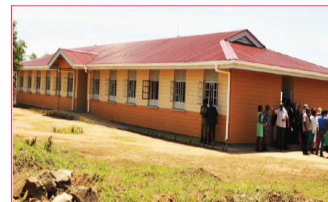
A Girl's dormitory at Nakapiripirit Primary School constructed under the Irish funded KPEP

To ensure improved standards of education in the region, teachers' housing units have been constructed by the Ministry and under NUSAF 2, while four dormitories equipped with beds and solar lighting system have been constructed in Lobalangit, Kacheri, Karita and Lolachat Primary Schools to improve on the retention of children in schools especially the girl child. In addition 21 Primary schools in the seven Districts in Karamoja have been constructed and rehabilitated under the Irish Aid funded Karamoja Primary Education Project (KPEP).