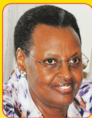
Hon. Janet Kataha Museveni Minister of Karamoja Affairs