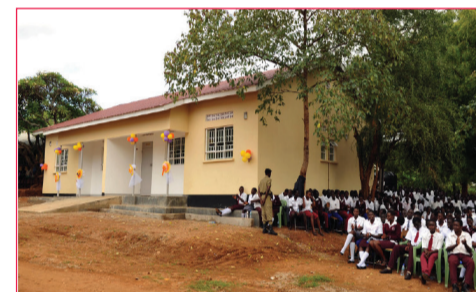
Twin Staff House constructed by the Ministry of Karamoja Affairs at Moroto High School