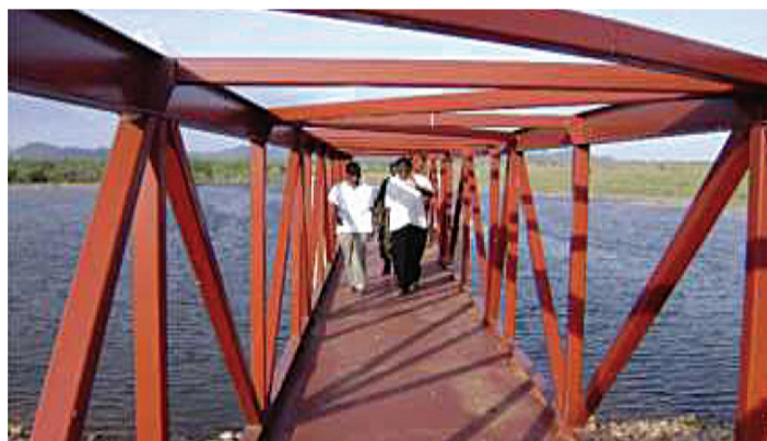
MWE officials inspecting the access bridge at Kobebe dam in Moroto District

The Karamoja Region, in north-eastern Uganda, is a semi-arid area covering approximately 27,200sq km with an estimated population of about 1.2 million people. It comprises the districts of Kaabong, Kotido, Abim, Napak, Moroto, Nakapiripirit and Amudat.