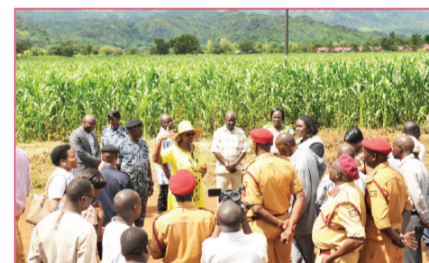
The Karamoja Affairs Minister with the Namalu Prison Staff and WFP Officials during one of the field visits to check the progress of the 400 acres of maize planted under the school feeding programme

So far a total of 758 metric tonnes of maize flour have been produced in 2 phases under this partnership and distributed to Primary schools contributing up to about 20% of the school feeding requirement in Karamoja. A three phase electricity line will soon be extended to the farm.