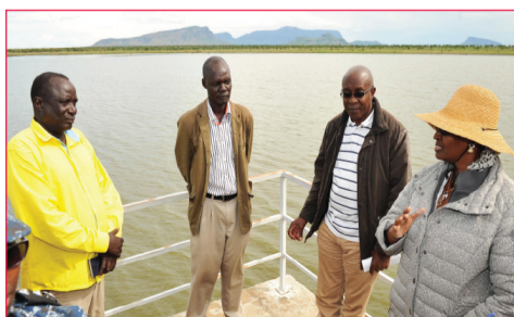
Arechek dam in Matany Sub county Napak District

The policy of the Ministry for Karamoja Affairs is to have valley tanks in every parish in the region. This is being done in collaboration with the Ministry of Water and Environment Protection. A total of 80 valley tanks have been constructed in the entire seven districts under the KIDP and the two sister programmes of Karamoja Livelihood Program (KALIP) and the Second Northern Uganda Social Action Fund (NUSAF2). In addition, 5 big valley dams namely Longoromit in Kaabong District, Kailong in Kotido, Kawomeri in Abim, Kobebe in Moroto and Arechek in Napak Districts have been constructed in collaboration with the Ministry of Water and Environment Protection.