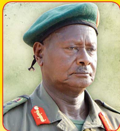
H. E. Gen Yoweri Kaguta Museveni. President of the Republic of Uganda