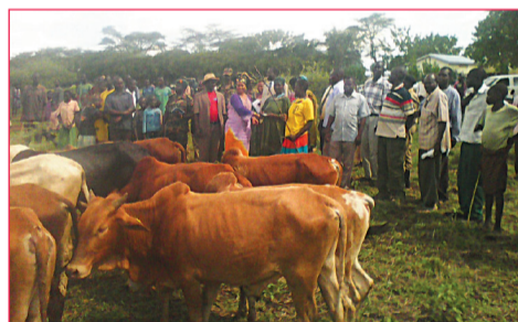
Outgoing Minister of State for Karamoja Hon. Barbara Oundo handing over animals to beneficiaries of the community empowerment programme

The Community Empowerment programme has been implemented by the Karamoja Affairs Ministry as a strategy for improving livelihoods and household incomes. Since 2011 to date, 7,600 oxen and 4,965 heifers have been distributed to 9,825 households in Karamoja. A total of 3,000 local goats were also distributed to women and youth groups to improve incomes at household levels and this year 500 improved He-goats will be given to selected farmers per Sub County to improve breeds.