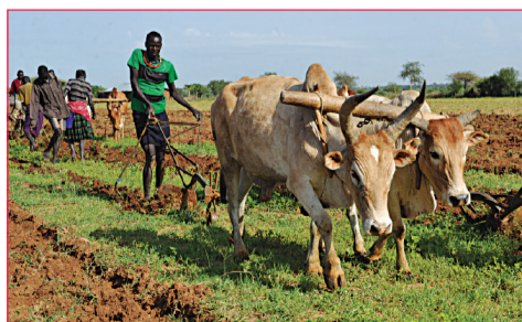
Beneficiaries of Ox plough in Kangole, Napak

The Ministry is also supporting small-holder farmers through Nabuin ZARDI to improve milk yields of dairy cattle in Karamoja region and also improve mature weights and growth rate of beef cattle among progressive farmers.