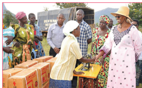
First Lady Janet Museveni handing over sewing machines to women groups in Abim District

To enhance economic empowerment of women, grinding mills have been installed in all the sub counties of Karamoja to help women raise income for themselves. They will also be used for milling their grains for consumption and value addition for markets. Sewing machines have been provided to the women groups to earn income and to schools and technical institutions for training and imparting practical skills to beneficiaries.