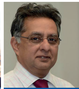
Cllr Ravi Govindia Leader of Wandsworth Council

who can grasp that whole system approach.'