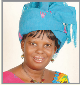
Hon. Betty Amongi MINISTER OF LANDS, HOUSING AND URBAN DEVELOPMENT