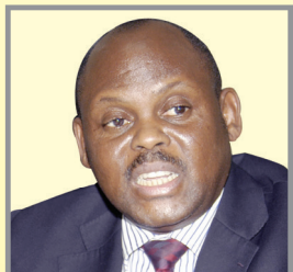
Hon. Isaac Musumba MINISTER OF STATE FOR URBAN DEVELOPMENT