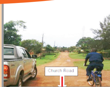
ENTEBBE- CHURCH ROAD BEFORE USMID