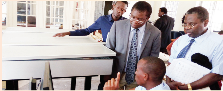
New equipment provided under the project to digitalize all Maps in the department.