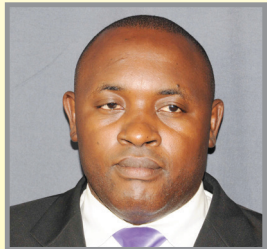
Hon. Chris Baryomunsi MINISTER OF STATE FOR HOUSING