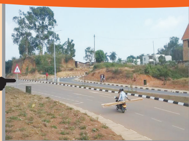
MASAKA- YELLOW KNIFE CURRENT STATE