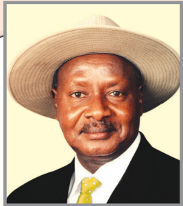
HE Yoweri Kaguta Museveni PRESIDENT OF THE REPUBLIC OF UGANDA