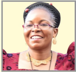
Hon. Persis Namuganza MINISTER OF STATE FOR LANDS