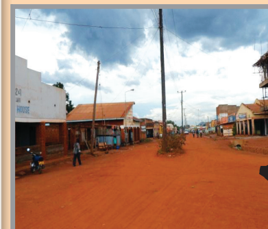
LIRA- ADUKU ROAD- BEFORE USMID