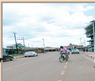
LIRA-ADUKU ROAD IN CURRENT STATE