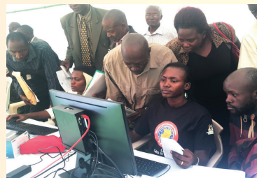
Land owners verifying their land titles using the Digital Register of Office of Titles