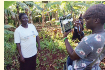
Using SLAAC data capture software collect information on land owners and boundaries for processing titles. The exercise is underway in Jinja, Sheema and Apac.