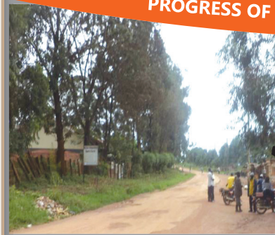
MASAKA- YELLOW KNIFE BEFORE USMID