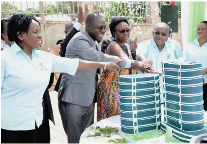
A cake shaped like the NDA towers is cut at the ground breaking.