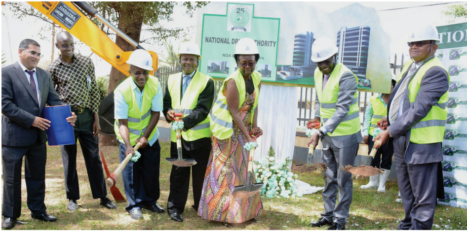
The minister of Health, Dr. Jane Ruth Aceng flanked by NDA officials & the contractors break ground for the new NDA Towers

We have done this by gradually building capacity: today, NDA has a presence at all drug supply chain levels. Quality assurance measures start