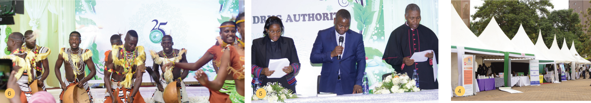
Clockwise: (1) The Anniversary cake is cut. (2) Minister of Health, Dr. Aceng. (3) NDA & MoH officials with religious leaders at the Thanks Giving Breakfast. (4) A section of the NDA Expo. (5) Religious leaders guide the prayer breakfast. (6) Ndere Troupe entertain dinner guests.