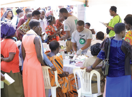
A section of patients that came for the free NDA medical camp in Kamuli.