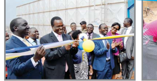
Hon Minister for Water and Environment together with the Chairman board of directors and MD NWSC commissioning a 1,000ltrs capacity reservior in Kanyanaya as part of the Corporations Water Stabilization