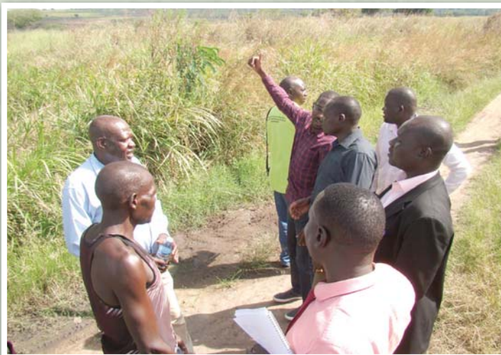
Eliminating road chokes to enhance efficiency of road networks for farmers in collaboration with the Ministry of Works and Transport as well as Ministry of Local Government.