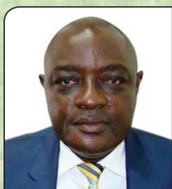
Hon. Vincent Bamulangaki Sempijja Minister for Agriculture, Animal Industry and Fisheries