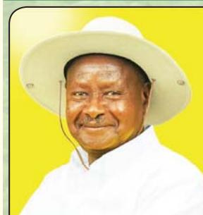
H.E. Yoweri Kaguta Museveni The President of the Republic of Uganda