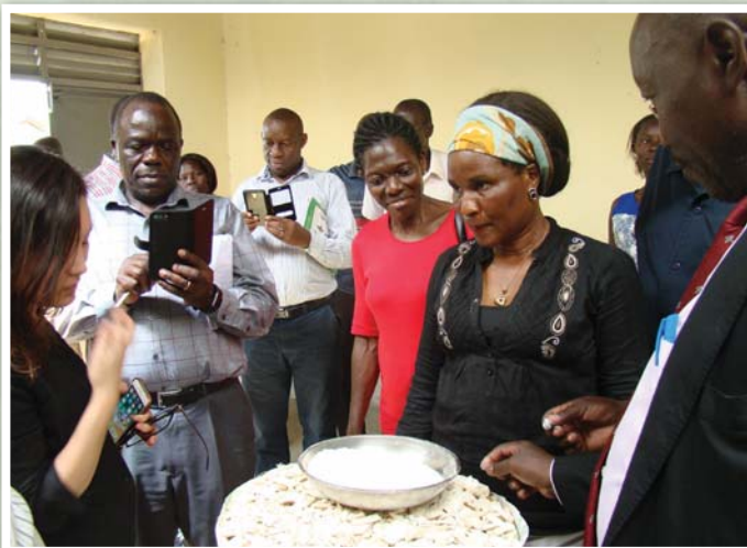
Stakeholders engagement to increase awareness of roll-out of the project.