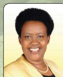
Hon. Joy Kabatsi State Minister for Animal Industry