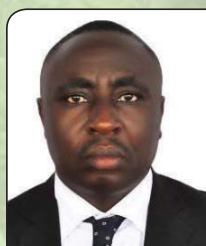
Hon. Christopher Kibanzanga State Minister for Agriculture