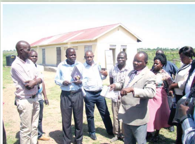
Training of Agro-input dealers