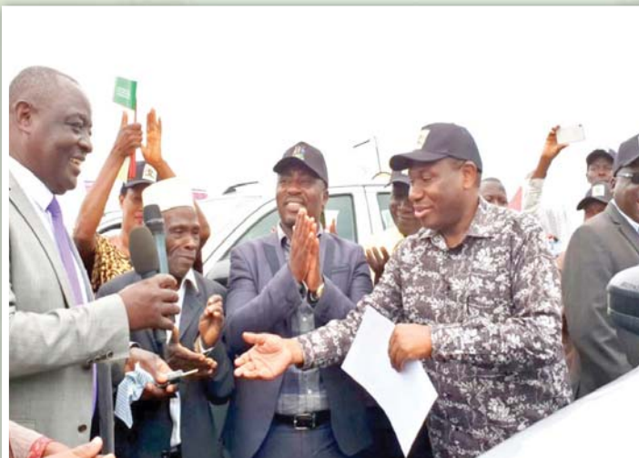
Introduction of the E-voucher system to ease access to quality farm inputs including seeds, fertilizers, agro-chemicals and post-harvest Equipment